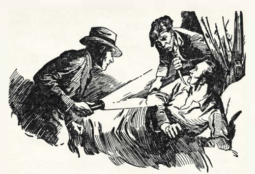
flick, and you're a dead man," Slate said