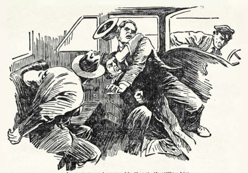
An arm passed across his throat, throttling him