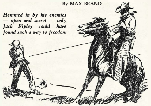
The noose dropped over the shoulders of the howling Chinaman