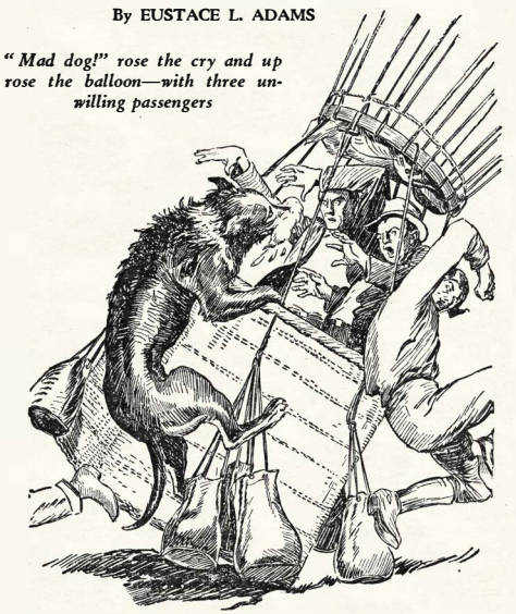
The dog leaped for the basket—went in

FISH GAGE, chief demonstrator for the Apex Airplane Company, was on the water wagon. Except for a few bottles of beer at every short pause in the conversation, and a sufficient medicinal hoot of Hennessey's Four Star Brandy to enable his astonished system to with-