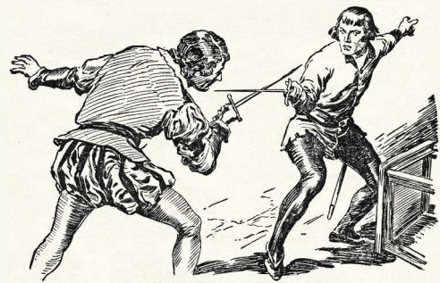
My sword is enough," sald Tizzo. " Come on!"

But Tizzo himself was not warm, but his shoulders were as strong and All the exercise of wielding the strong